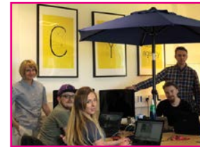
INTERACTIVE MEDIA BSC (HONS)

This award recognises the efforts of a collective in supporting the student journey; which involves so much more than just one academic – nominations recognise the breadth of support offered from teams and the collegiality which is displayed within Ulster University.