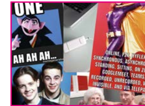
MSC APPLIED PSYCHOLOGY (MENTAL HEALTH AND PSYCHOLOGICAL THERAPIES)

What our students' have said... "This team are the most down-to-earth academics I have ever met. They are supportive, inspiring, motivated, and always put the needs of the group first. Masters study is not easy, and many of my peers, myself included, have struggled with the highs and lows of life this academic year, but not once have we not felt supported along the way."