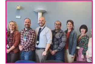
PHARMACY MPharm (HONS)

What our students' have said... "I am so grateful I have had the opportunity to not only study at Ulster, but to have met and been educated by a fantastic body of staff who take such great care in their students and ensure the student learning experience is at the highest possible level. I thank each and every one of them for a spectacular experience here at Ulster and for making my time so memorable."